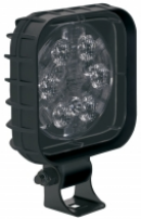
Part Number 1300011 12-24V LED Work Light with Trapezoid Beam Pattern