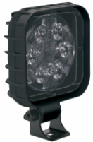
Part Number 1300101 12-110V LED Work Light with Spot Beam Pattern