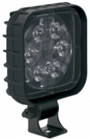
Part Number 1300101 12-110V LED Work Light with Spot Beam Pattern