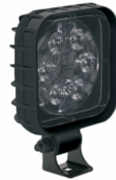
Part Number 1300091 12-110V LED Work Light with Flood Beam Pattern