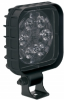
Part Number 1300301 12-48V LED Work Light with Left Hand Vertical Flood Beam Pattern