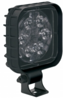
Part Number 1300021 12-24V LED Work Light with Spot Beam Pattern