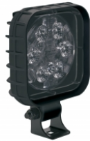
Part Number 1300031 12-110V LED Work Light with Trapezoid Beam Pattern & Integrated 2-Pin Deutsch Connector