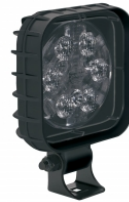
Part Number 1300091 12-110V LED Work Light with Flood Beam Pattern