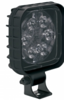
Part Number 1300041 12-110V LED Work Light with Trapezoid Beam Pattern & Integrated AMP Connector