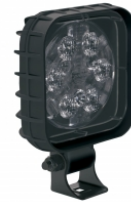
Part Number 1300041 12-110V LED Work Light with Trapezoid Beam Pattern & Integrated AMP Connector