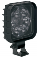
Part Number 1300311 12-48V LED Work Light with Right Hand Vertical Flood Beam Pattern