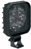
Part Number 1300021 12-24V LED Work Light with Spot Beam Pattern