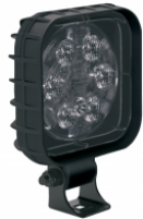
Part Number 1300301 12-48V LED Work Light with Left Hand Vertical Flood Beam Pattern