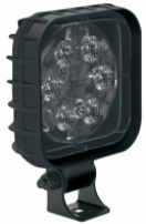
Part Number 1300011 12-24V LED Work Light with Trapezoid Beam Pattern