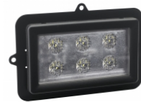
Part Number 0547431 12V LED Work Light with Flood Beam Pattern & Combine Retrofit Mount