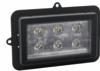
Part Number 0547431 12V LED Work Light with Flood Beam Pattern & Combine Retrofit Mount