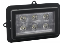
Part Number 0547431 12V LED Work Light with Flood Beam Pattern & Combine Retrofit Mount