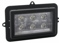
Part Number 0547431 12V LED Work Light with Flood Beam Pattern & Combine Retrofit Mount