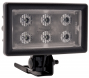
Part Number 0545971 12V LED Work Light with Flood Beam Pattern & Bottom Mount