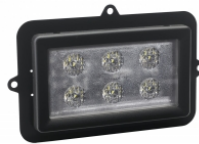
Part Number 0547431 12V LED Work Light with Flood Beam Pattern & Combine Retrofit Mount