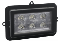
Part Number 0547431 12V LED Work Light with Flood Beam Pattern & Combine Retrofit Mount