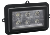
Part Number 0547431 12V LED Work Light with Flood Beam Pattern & Combine Retrofit Mount