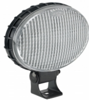
Part Number 1706241 12-48V LED Work Light with Flood Beam Pattern & DT04-2P Connector