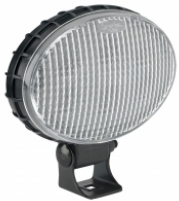
Part Number 1706041 12V LED Work Light with Flood Beam Pattern & DT04-2P Connector