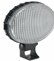
Part Number 1706251 12-48V LED Work Light with Trapezoid Beam Pattern & DT04-2P Connector