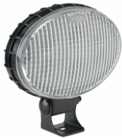
Part Number 1706051 12V LED Work Light with Trapezoid Beam Pattern & DT04-2P Connector