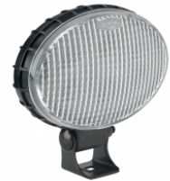
Part Number 1706261 12-48V LED Work Light with Spot Beam Pattern & DT04-2P Connector