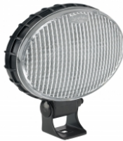
Part Number 1706051 12V LED Work Light with Trapezoid Beam Pattern & DT04-2P Connector