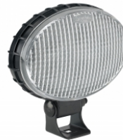
Part Number 1706251 12-48V LED Work Light with Trapezoid Beam Pattern & DT04-2P Connector