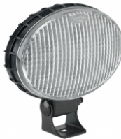
Part Number 1706241 12-48V LED Work Light with Flood Beam Pattern & DT04-2P Connector