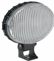
Part Number 1706051 12V LED Work Light with Trapezoid Beam Pattern & DT04-2P Connector