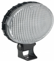
Part Number 1706041 12V LED Work Light with Flood Beam Pattern & DT04-2P Connector