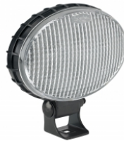
Part Number 1706241 12-48V LED Work Light with Flood Beam Pattern & DT04-2P Connector