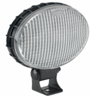
Part Number 1706461 12-48V LED Work Light with Flood Beam Pattern & PE12015792 Connector