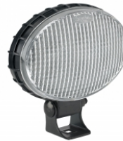
Part Number 1706261 12-48V LED Work Light with Spot Beam Pattern & DT04-2P Connector