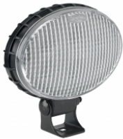
Part Number 1706041 12V LED Work Light with Flood Beam Pattern & DT04-2P Connector