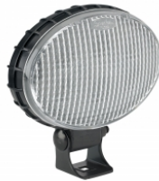
Part Number 1706241 12-48V LED Work Light with Flood Beam Pattern & DT04-2P Connector