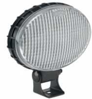
Part Number 1706461 12-48V LED Work Light with Flood Beam Pattern & PE12015792 Connector