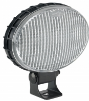
Part Number 1706051 12V LED Work Light with Trapezoid Beam Pattern & DT04-2P Connector