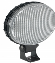
Part Number 1706261 12-48V LED Work Light with Spot Beam Pattern & DT04-2P Connector