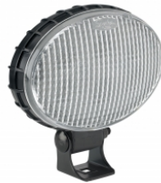
Part Number 1706251 12-48V LED Work Light with Trapezoid Beam Pattern & DT04-2P Connector