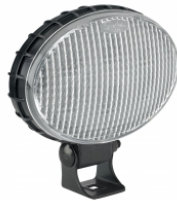
Part Number 1706051 12V LED Work Light with Trapezoid Beam Pattern & DT04-2P Connector