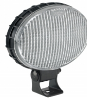
Part Number 1706261 12-48V LED Work Light with Spot Beam Pattern & DT04-2P Connector