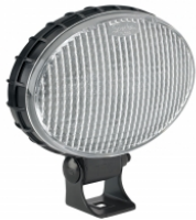
Part Number 1706241 12-48V LED Work Light with Flood Beam Pattern & DT04-2P Connector