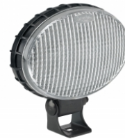
Part Number 1706461 12-48V LED Work Light with Flood Beam Pattern & PE12015792 Connector