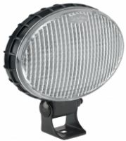
Part Number 1706041 12V LED Work Light with Flood Beam Pattern & DT04-2P Connector