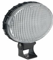
Part Number 1706251 12-48V LED Work Light with Trapezoid Beam Pattern & DT04-2P Connector