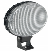
Part Number 1706321 12V LED Work Light with Spot Beam Pattern & DT04-2P Connector