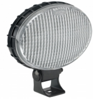
Part Number 1706461 12-48V LED Work Light with Flood Beam Pattern & PE12015792 Connector