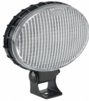
Part Number 1706241 12-48V LED Work Light with Flood Beam Pattern & DT04-2P Connector