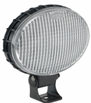
Part Number 1706461 12-48V LED Work Light with Flood Beam Pattern & PE12015792 Connector