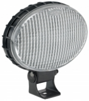
Part Number 1706041 12V LED Work Light with Flood Beam Pattern & DT04-2P Connector