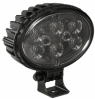
Part Number 1706571 12-24V LED Work Light with Spot Beam Pattern