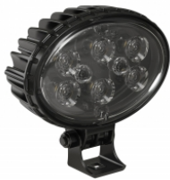
Part Number 1706571 12-24V LED Work Light with Spot Beam Pattern