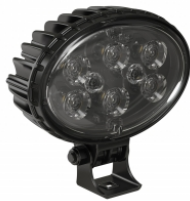
Part Number 1706581 12-24V LED Work Light with Trapezoid Beam Pattern