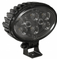
Part Number 1706581 12-24V LED Work Light with Trapezoid Beam Pattern