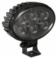
Part Number 1706581 12-24V LED Work Light with Trapezoid Beam Pattern