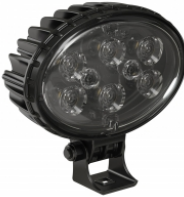
Part Number 1706591 12-24V LED Work Light with Flood Beam Pattern