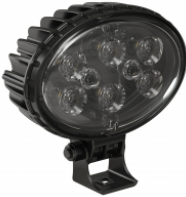
Part Number 1706571 12-24V LED Work Light with Spot Beam Pattern