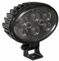
Part Number 1706591 12-24V LED Work Light with Flood Beam Pattern