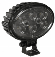
Part Number 1706581 12-24V LED Work Light with Trapezoid Beam Pattern