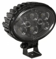
Part Number 1706591 12-24V LED Work Light with Flood Beam Pattern