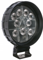
Part Number 1501651 12-24V LED Work Light with Trapezoid Beam Pattern