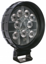
Part Number 1501641 12-24V LED Work Light with Flood Beam Pattern