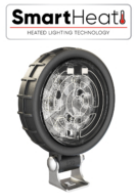
4.5" Round Heated & Non-Heated Work Lamps