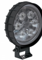
Part Number 1403281 12-110V LED Work Light with Spot Beam Pattern