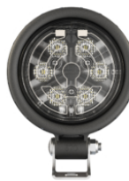
Part Number 1403471 12-24V LED Heated Work Light with Flood Beam Pattern