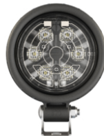
Part Number 1403481 12-24V LED Heated Work Light with Spot Beam Pattern