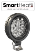
Part Number 1403291 12-110V LED Work Light with Flood Beam Pattern