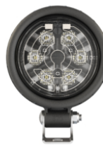
Part Number 1403481 12-24V LED Heated Work Light with Spot Beam Pattern