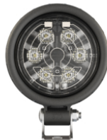
Part Number 1403471 12-24V LED Heated Work Light with Flood Beam Pattern