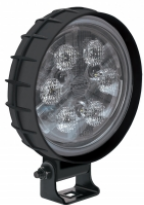
Part Number 1403291 12-110V LED Work Light with Flood Beam Pattern