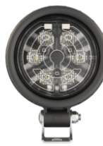
Part Number 1403471 12-24V LED Heated Work Light with Flood Beam Pattern