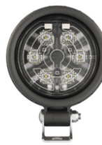
Part Number 1403481 12-24V LED Heated Work Light with Spot Beam Pattern