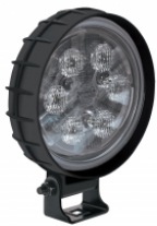
Part Number 1403291 12-110V LED Work Light with Flood Beam Pattern