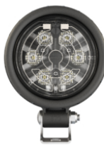
Part Number 1403471 12-24V LED Heated Work Light with Flood Beam Pattern