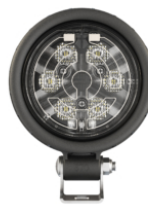
Part Number 1403481 12-24V LED Heated Work Light with Spot Beam Pattern