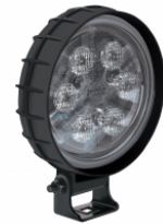
Part Number 1403291 12-110V LED Work Light with Flood Beam Pattern