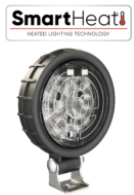
Part Number 1403251 12-24V LED Work Light with Trapezoid Beam Pattern