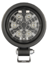
Part Number 1403471 12-24V LED Heated Work Light with Flood Beam Pattern