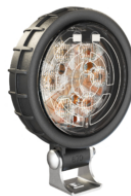
Part Number 1403491 12-24V LED Heated Amber Work Light with Flood Beam Pattern