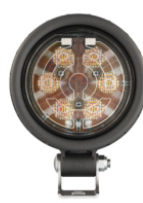
Part Number 1403491 12-24V LED Heated Amber Work Light with Flood Beam Pattern