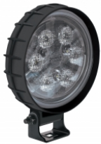
Part Number 1403251 12-24V LED Work Light with Trapezoid Beam Pattern