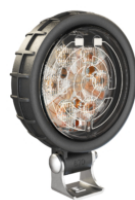
Part Number 1403491 12-24V LED Heated Amber Work Light with Flood Beam Pattern