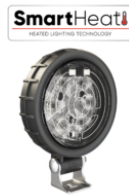
Part Number 1403261 12-24V LED Work Light with Spot Beam Pattern