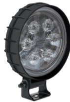
Part Number 1403261 12-24V LED Work Light with Spot Beam Pattern