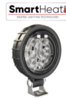
Part Number 1403281 12-110V LED Work Light with Spot Beam Pattern