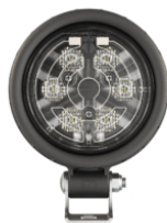
Part Number 1403481 12-24V LED Heated Work Light with Spot Beam Pattern