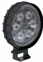
Part Number 1403261 12-24V LED Work Light with Spot Beam Pattern