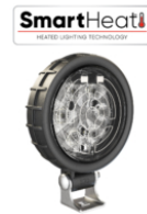
Part Number 1403291 12-110V LED Work Light with Flood Beam Pattern