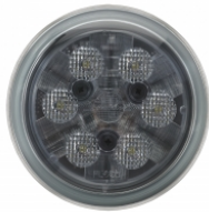
Part Number 3157471 12-48V LED Work Light with Polycarbonate Lens & Flood Beam Pattern