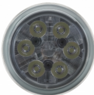
Part Number 3157581 12-48V LED Work Light with Glass Lens & Spot Beam Pattern