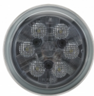
Part Number 8000111 12V LED Work Light with Polycarbonate Lens & Flood Beam Pattern