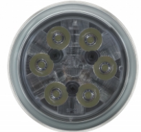
Part Number 3157491 12-48V LED Work Light with Polycarbonate Lens & Spot Beam Pattern