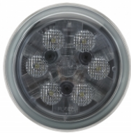
Part Number 3157301 12V LED Work Light with Glass Lens & Trapezoid Beam Pattern