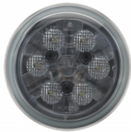
Part Number 3157291 12V LED Work Light with Glass Lens & Flood Beam Pattern