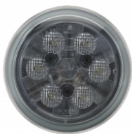
Part Number 3157601 12-48V LED Work Light with Glass Lens & Flood Beam Pattern