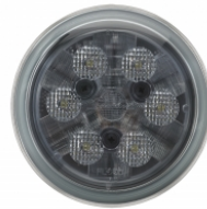
Part Number 3157481 12-48V LED Work Light with Polycarbonate Lens & Trapezoid Beam Pattern