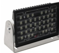
Part Number 0551451 12-24V LED Work Light with Wide Flood Beam Pattern