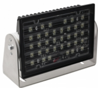
Part Number 0544021 120V LED Work Light Kit with Tripod