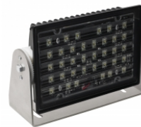
Part Number 0551441 12-24V LED Work Light with Narrow Flood Beam Pattern