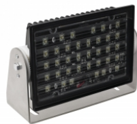
Part Number 0551431 12-24V LED Work Light with Medium Flood Beam Pattern