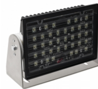
Part Number 0551431 12-24V LED Work Light with Medium Flood Beam Pattern