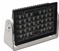
Part Number 0551441 12-24V LED Work Light with Narrow Flood Beam Pattern