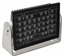
Part Number 0551451 12-24V LED Work Light with Wide Flood Beam Pattern