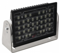
Part Number 0544021 120V LED Work Light Kit with Tripod