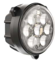
Part Number 0555461 12-24V LED Work Light with Flood Pattern & Panel Mount