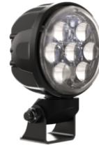
Part Number 0554201

12-24V LED Work Light with Spot Pattern & Side View Mirror Mount - 2 Light Kit