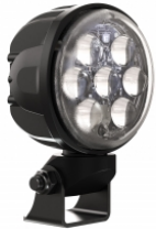
Part Number 0549841

12-24V LED Work Light with Trapezoid Pattern