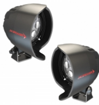
Part Number 0551753

12-24V LED Work Light with Spot Pattern & Side View Mirror Mount - 2 Light Kit