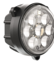
Part Number 0555341 12-24V LED Work Light with Spot Pattern & Panel Mount