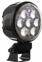
Part Number 0549841 12-24V LED Work Light with Trapezoid Pattern