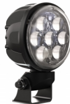
Part Number 0551001 12-24V LED Work Light with Spot Pattern