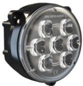
Part Number 0560341

12-24V LED Work Light with Spot Pattern & Side View Mirror Mount with Camera - 2 Light Kit