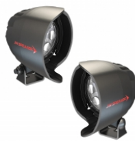
Part Number 0551753 12-24V LED Work Light with Spot Pattern & Side View Mirror Mount - 2 Light Kit