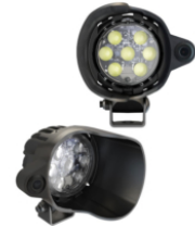
Part Number 0559913

12-110V LED Work Light with Trapezoid Pattern