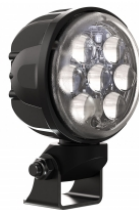
Part Number 0551001 12-24V LED Work Light with Spot Pattern