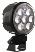
Part Number 0551001 12-24V LED Work Light with Spot Pattern