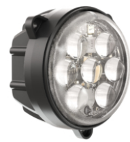
Part Number 0555461 12-24V LED Work Light with Flood Pattern & Panel Mount