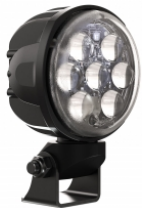
Part Number 0549841 12-24V LED Work Light with Trapezoid Pattern