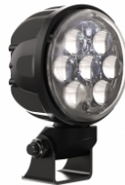
Part Number 0551001 12-24V LED Work Light with Spot Pattern