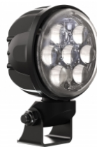
Part Number 0551001 12-24V LED Work Light with Spot Pattern