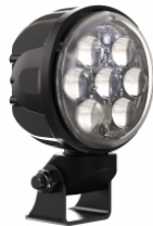
Part Number 0551001 12-24V LED Work Light with Spot Pattern