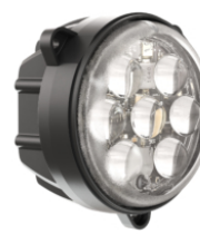
Part Number 0555461 12-24V LED Work Light with Flood Pattern & Panel Mount