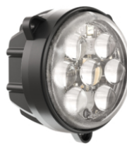
Part Number 0555341 12-24V LED Work Light with Spot Pattern & Panel Mount