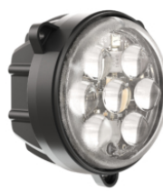
Part Number 0555341 12-24V LED Work Light with Spot Pattern & Panel Mount