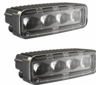
Part Number 1603603 12V DOT/ECE LED Fog Light - 2 Light Kit