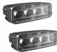
Part Number 1603603 12V DOT/ECE LED Fog Light - 2 Light Kit