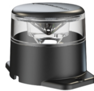
Part Number 0646471 12-80V Blue Class III LED Strobe Light with Flange Mount