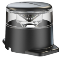
Part Number 0646451 12-80V Red Class III LED Strobe Light with Flange Mount