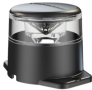
Part Number 0646461 12-80V Green Class III LED Strobe Light with Flange Mount