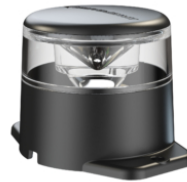
Part Number 0646471 12-80V Blue Class III LED Strobe Light with Flange Mount