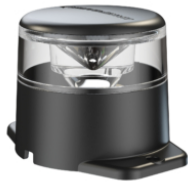
Part Number 0646461 12-80V Green Class III LED Strobe Light with Flange Mount