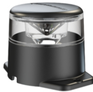
Part Number 0646471 12-80V Blue Class III LED Strobe Light with Flange Mount