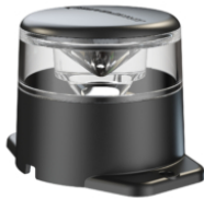
Part Number 0646451 12-80V Red Class III LED Strobe Light with Flange Mount