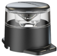
Part Number 0646451 12-80V Red Class III LED Strobe Light with Flange Mount