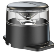
Part Number 0646481 12-80V White Class III LED Strobe Light with Flange Mount