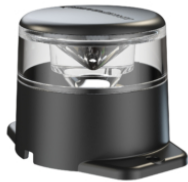
Part Number 0646471 12-80V Blue Class III LED Strobe Light with Flange Mount