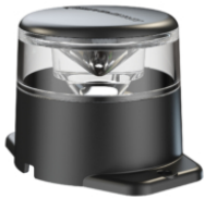
Part Number 0646451 12-80V Red Class III LED Strobe Light with Flange Mount