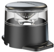
Part Number 0646461 12-80V Green Class III LED Strobe Light with Flange Mount