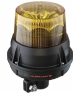
Part Number 0646741 12-80V LED Amber Class I Strobe Light with DIN Pole Mount