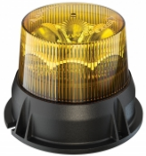
Part Number 0646491 12-80V LED Amber Class I Strobe Light