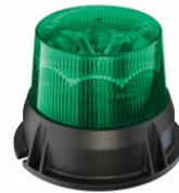
Part Number 0646571 12-80V LED Green Class I Strobe Light