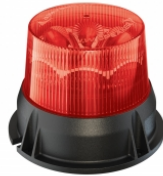
Part Number 0646561 12-80V LED Red Class I Strobe Light