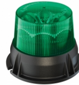
Part Number 0646571 12-80V LED Green Class I Strobe Light