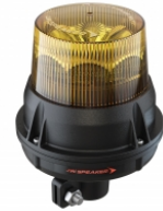
Part Number 0646741 12-80V LED Amber Class I Strobe Light with DIN Pole Mount