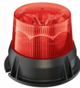
Part Number 0646561 12-80V LED Red Class I Strobe Light