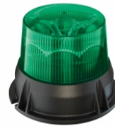
Part Number 0646571 12-80V LED Green Class I Strobe Light