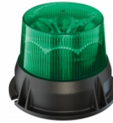
Part Number 0646571 12-80V LED Green Class I Strobe Light