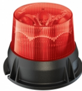
Part Number 0646561 12-80V LED Red Class I Strobe Light