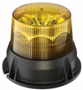
Part Number 0646491 12-80V LED Amber Class I Strobe Light