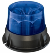
Part Number 0646551 12-80V LED Blue Class I Strobe Light