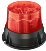
Part Number 0646561 12-80V LED Red Class I Strobe Light