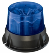
Part Number 0646551 12-80V LED Blue Class I Strobe Light