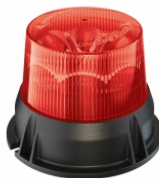
Part Number 0646561