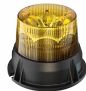
Part Number 0646891

12-80V LED Amber Class I Strobe Light with Magnet Mount