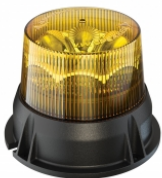
Part Number 0646491