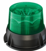
Part Number 0646571