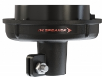
Part Number 8200213 DIN Pole Mount for 406 & 407 LED Strobe Lights