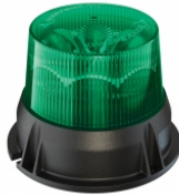
Part Number 0646571 12-80V LED Green Class I Strobe Light