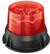
Part Number 0646561 12-80V LED Red Class I Strobe Light