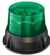
Part Number 0646571 12-80V LED Green Class I Strobe Light