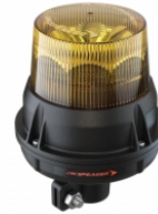
Part Number 0646741 12-80V LED Amber Class I Strobe Light with DIN Pole Mount