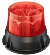
Part Number 0646561 12-80V LED Red Class I Strobe Light