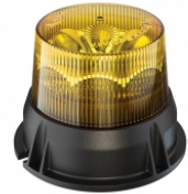
Part Number 0646891 12-80V LED Amber Class I Strobe Light with Magnet Mount