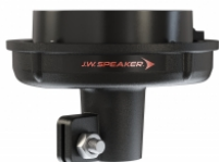
Part Number 8200213 DIN Pole Mount for 406 & 407 LED Strobe Lights