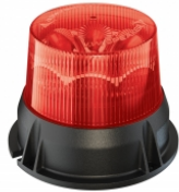
Part Number 0646561 12-80V LED Red Class I Strobe Light