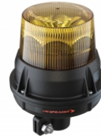
Part Number 0646741 12-80V LED Amber Class I Strobe Light with DIN Pole Mount