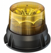
Part Number 0646891 12-80V LED Amber Class I Strobe Light with Magnet Mount