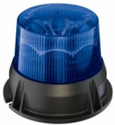
Part Number 0646551 12-80V LED Blue Class I Strobe Light