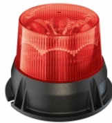
Part Number 0646561 12-80V LED Red Class I Strobe Light