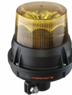
Part Number 0646741 12-80V LED Amber Class I Strobe Light with DIN Pole Mount