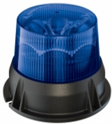
Part Number 0646551 12-80V LED Blue Class I Strobe Light