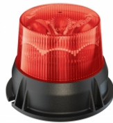
Part Number 0646541 12-80V LED Red Class II Strobe Light