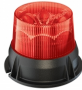
Part Number 0646541 12-80V LED Red Class II Strobe Light