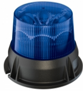
Part Number 0646531 12-80V LED Blue Class II Strobe Light