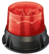
Part Number 0646541 12-80V LED Red Class II Strobe Light