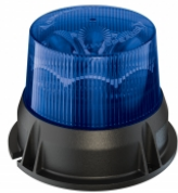
Part Number 0646531 12-80V LED Blue Class II Strobe Light