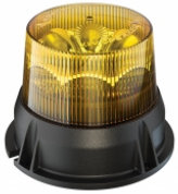
Part Number 0646501 12-80V LED Amber Class II Strobe Light