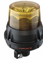
Part Number 0646731 12-80V LED Amber Class II Strobe Light with DIN Pole Mount