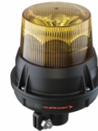
Part Number 0646731 12-80V LED Amber Class II Strobe Light with DIN Pole Mount