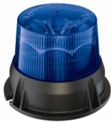
Part Number 0646531 12-80V LED Blue Class II Strobe Light