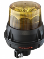
Part Number 0646731 12-80V LED Amber Class II Strobe Light with DIN Pole Mount