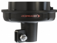
Part Number 8200213

Pipe Mount with Weld-on Bracket for DIN Pole Mount