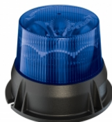
Part Number 0646531