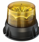
Part Number 0646881 12-80V LED Amber Class II Strobe Light with Magnet Mount & Adapter