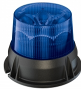
Part Number 0646531 12-80V LED Blue Class II Strobe Light