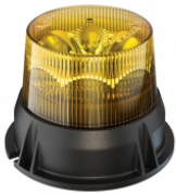
Part Number 0646501 12-80V LED Amber Class II Strobe Light