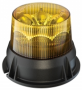
Part Number 0646501 12-80V LED Amber Class II Strobe Light