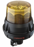
Part Number 0646731 12-80V LED Amber Class II Strobe Light with DIN Pole Mount