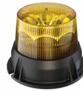
Part Number 0646881 12-80V LED Amber Class II Strobe Light with Magnet Mount & Adapter