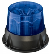
Part Number 0646531 12-80V LED Blue Class II Strobe Light