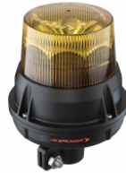
Part Number 0646731 12-80V LED Amber Class II Strobe Light with DIN Pole Mount