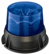
Part Number 0646531 12-80V LED Blue Class II Strobe Light