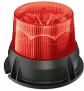
Part Number 0646541 12-80V LED Red Class II Strobe Light