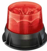
Part Number 0646541 12-80V LED Red Class II Strobe Light