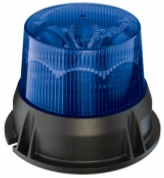
Part Number 0646531 12-80V LED Blue Class II Strobe Light