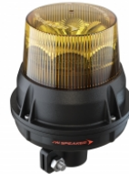
Part Number 0646731 12-80V LED Amber Class II Strobe Light with DIN Pole Mount