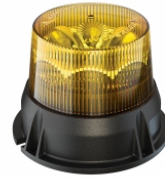
Part Number 0646881 12-80V LED Amber Class II Strobe Light with Magnet Mount & Adapter