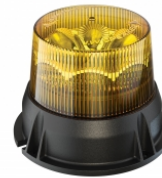
Part Number 0646881 12-80V LED Amber Class II Strobe Light with Magnet Mount & Adapter