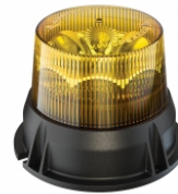
Part Number 0646881 12-80V LED Amber Class II Strobe Light with Magnet Mount & Adapter