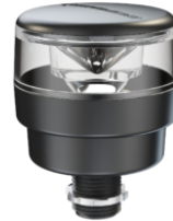
Part Number 0646421 12-80V Blue Class III LED Strobe Light with Pipe Mount