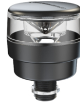
Part Number 0646421 12-80V Blue Class III LED Strobe Light with Pipe Mount