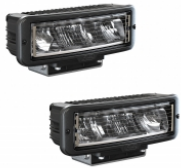
Part Number 0551863 24V ECE LED LHT Heated Headlight - 2 Light Kit