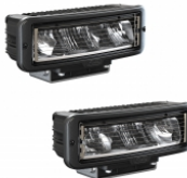
Part Number 0552243 12V DOT LED Heated Headlight - 2 Light Kit