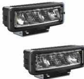
Part Number 0552433 12V ECE LED LHT Heated Headlight - 2 Light Kit