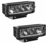
Part Number 0552433 12V ECE LED LHT Heated Headlight - 2 Light Kit