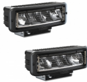
Part Number 0552243 12V DOT LED Heated Headlight - 2 Light Kit