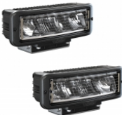
Part Number 0551863 24V ECE LED LHT Heated Headlight - 2 Light Kit