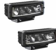
Part Number 0551803 24V DOT LED Heated Headlight - 2 Light Kit