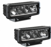
Part Number 0550171 12-24V ECE LED LHT Non-Heated Headlight - 2 Light Kit