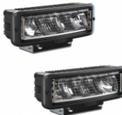
Part Number 0552433 12V ECE LED LHT Heated Headlight - 2 Light Kit