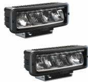
Part Number 0550171 12-24V ECE LED LHT Non-Heated Headlight - 2 Light Kit