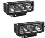
Part Number 0551833 24V ECE LED RHT Heated Headlight - 2 Light Kit