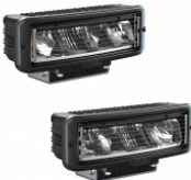
Part Number 0552243 12V DOT LED Heated Headlight - 2 Light Kit