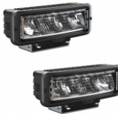
Part Number 0552433 12V ECE LED LHT Heated Headlight - 2 Light Kit