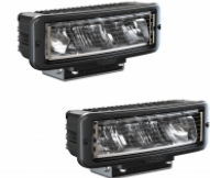
Part Number 0551833 24V ECE LED RHT Heated Headlight - 2 Light Kit