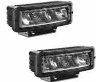
Part Number 0551833 24V ECE LED RHT Heated Headlight - 2 Light Kit