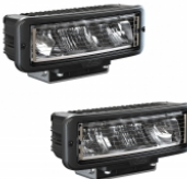
Part Number 0552423 12V ECE LED RHT Heated Headlight - 2 Light Kit