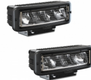
Part Number 0551803 24V DOT LED Heated Headlight - 2 Light Kit