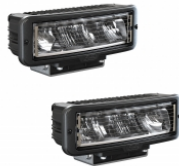
Part Number 0552433 12V ECE LED LHT Heated Headlight - 2 Light Kit