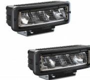
Part Number 0551803 24V DOT LED Heated Headlight - 2 Light Kit