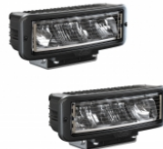
Part Number 0552433 12V ECE LED LHT Heated Headlight - 2 Light Kit