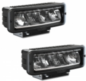
Part Number 0550161 12-24V ECE LED RHT Non-Heated Headlight - 2 Light Kit