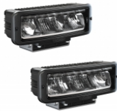
Part Number 0550171 12-24V ECE LED LHT Non-Heated Headlight - 2 Light Kit