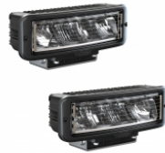
Part Number 0552433 12V ECE LED LHT Heated Headlight - 2 Light Kit