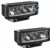
Part Number 0552423 12V ECE LED RHT Heated Headlight - 2 Light Kit