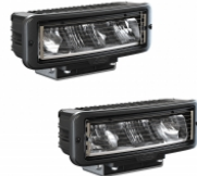
Part Number 0551803 24V DOT LED Heated Headlight - 2 Light Kit