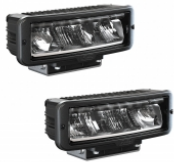
Part Number 0550161 12-24V ECE LED RHT Non-Heated Headlight - 2 Light Kit