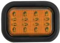
Part Number 0343921 12-24V ECE/SAE LED Turn Signal Light