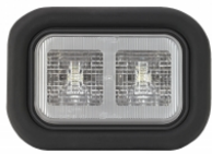
Part Number 0443081 12-24V ECE/SAE LED Backup Light