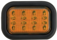
Part Number 0343921 12-24V ECE/SAE LED Turn Signal Light