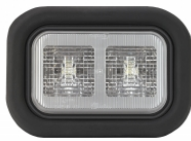
Part Number 0443081 12-24V ECE/SAE LED Backup Light