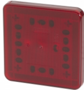
Part Number 0342361 12-24V LED Rear Fog Light