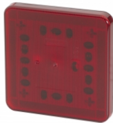
Part Number 0342361 12-24V LED Rear Fog Light