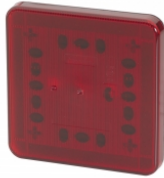
Part Number 0342361 12-24V LED Rear Fog Light