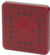
Part Number 0342361 12-24V ECE LED Rear Fog Light with Harness