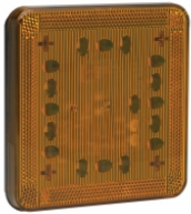
Part Number 0342291 12-24V ECE/SAE LED Turn Signal Light