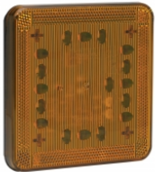
Part Number 0342291 12-24V ECE/SAE LED Turn Signal Light