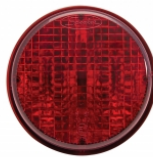
Part Number 0345431 12-24V ECE LED Rear Fog Light (Red) without 90mm Mounting Assembly Adapter