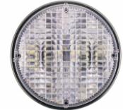
Part Number 0345461 12-24V ECE LED DRL & Front Position Light with 90mm Mounting Assembly Adapter