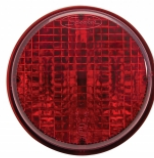
Part Number 0345431 12-24V ECE LED Rear Fog Light (Red) without 90mm Mounting Assembly Adapter