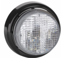
Part Number 0345451 12-24V ECE LED DRL & Front Position Light without 90mm Mounting Assembly Adapter