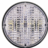
Part Number 0345511 12-24V ECE LED Rear Fog Light (Clear) without 90mm Mounting Assembly Adapter