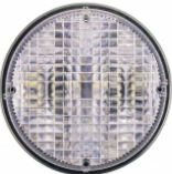
Part Number 0345461 12-24V ECE LED DRL & Front Position Light with 90mm Mounting Assembly Adapter