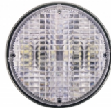
Part Number 0345421 12-24V ECE LED Backup Light without 90mm Mounting Assembly Adapter