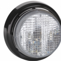
Part Number 0345451 12-24V ECE LED DRL & Front Position Light without 90mm Mounting Assembly Adapter