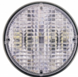
Part Number 0345511 12-24V ECE LED Rear Fog Light (Clear) without 90mm Mounting Assembly Adapter