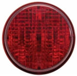
Part Number 0345411 12-24V ECE LED Stop & Tail Light without 90mm Mounting Assembly Adapter