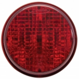
Part Number 0345411 12-24V ECE LED Stop & Tail Light without 90mm Mounting Assembly Adapter