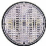
Part Number 0345461 12-24V ECE LED DRL & Front Position Light with 90mm Mounting Assembly Adapter