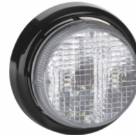
Part Number 0345451 12-24V ECE LED DRL & Front Position Light without 90mm Mounting Assembly Adapter