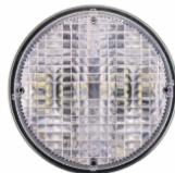
Part Number 0345511 12-24V ECE LED Rear Fog Light (Clear) without 90mm Mounting Assembly Adapter