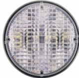
Part Number 0345421 12-24V ECE LED Backup Light without 90mm Mounting Assembly Adapter