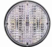
Part Number 0345461 12-24V ECE LED DRL & Front Position Light with 90mm Mounting Assembly Adapter