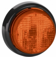
Part Number 0345521 12-24V ECE LED Turn Signal with 90mm Mounting Assembly Adapter