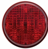
Part Number 0345431 12-24V ECE LED Rear Fog Light (Red) without 90mm Mounting Assembly Adapter