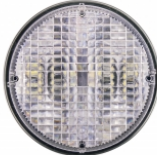
Part Number 0345421 12-24V ECE LED Backup Light without 90mm Mounting Assembly Adapter