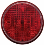
Part Number 0345411 12-24V ECE LED Stop & Tail Light without 90mm Mounting Assembly Adapter