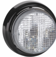
Part Number 0345451 12-24V ECE LED DRL & Front Position Light without 90mm Mounting Assembly Adapter