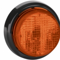
Part Number 0345521 12-24V ECE LED Turn Signal with 90mm Mounting Assembly Adapter