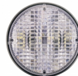
Part Number 0345461 12-24V ECE LED DRL & Front Position Light with 90mm Mounting Assembly Adapter