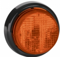
Part Number 0345521 12-24V ECE LED Turn Signal with 90mm Mounting Assembly Adapter