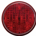
Part Number 0345431 12-24V ECE LED Rear Fog Light (Red) without 90mm Mounting Assembly Adapter