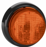
Part Number 0345521 12-24V ECE LED Turn Signal with 90mm Mounting Assembly Adapter