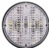
Part Number 0345421 12-24V ECE LED Backup Light without 90mm Mounting Assembly Adapter