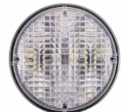
Part Number 0345461 12-24V ECE LED DRL & Front Position Light with 90mm Mounting Assembly Adapter