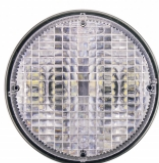
Part Number 0345511 12-24V ECE LED Rear Fog Light (Clear) without 90mm Mounting Assembly Adapter