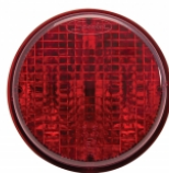
Part Number 0345431 12-24V ECE LED Rear Fog Light (Red) without 90mm Mounting Assembly Adapter