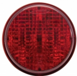
Part Number 0345411 12-24V ECE LED Stop & Tail Light without 90mm Mounting Assembly Adapter