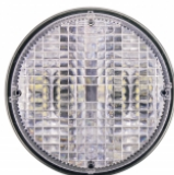
Part Number 0345511 12-24V ECE LED Rear Fog Light (Clear) without 90mm Mounting Assembly Adapter