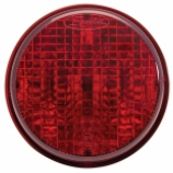
Part Number 0345411 12-24V ECE LED Stop & Tail Light without 90mm Mounting Assembly Adapter