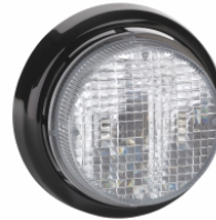
Part Number 0345451 12-24V ECE LED DRL & Front Position Light without 90mm Mounting Assembly Adapter