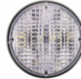
Part Number 0345461 12-24V ECE LED DRL & Front Position Light with 90mm Mounting Assembly Adapter