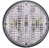
Part Number 0345421 12-24V ECE LED Backup Light without 90mm Mounting Assembly Adapter