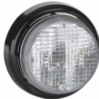
Part Number 0345451 12-24V ECE LED DRL & Front Position Light without 90mm Mounting Assembly Adapter