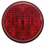
Part Number 0345431 12-24V ECE LED Rear Fog Light (Red) without 90mm Mounting Assembly Adapter