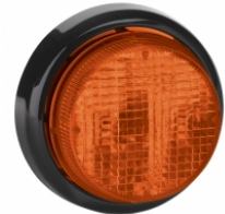
Part Number 0345521 12-24V ECE LED Turn Signal with 90mm Mounting Assembly Adapter