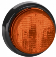
Part Number 0345521 12-24V ECE LED Turn Signal with 90mm Mounting Assembly Adapter