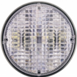
Part Number 0345511 12-24V ECE LED Rear Fog Light (Clear) without 90mm Mounting Assembly Adapter