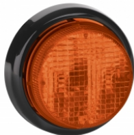
Part Number 0345521 12-24V ECE LED Turn Signal with 90mm Mounting Assembly Adapter