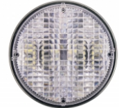
Part Number 0345461 12-24V ECE LED DRL & Front Position Light with 90mm Mounting Assembly Adapter