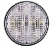
Part Number 0345461 12-24V ECE LED DRL & Front Position Light with 90mm Mounting Assembly Adapter