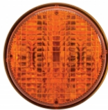
Part Number 0345441 12-24V ECE LED Turn Signal without 90mm Mounting Assembly Adapter