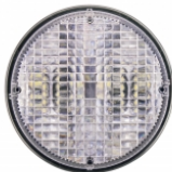
Part Number 0345511 12-24V ECE LED Rear Fog Light (Clear) without 90mm Mounting Assembly Adapter