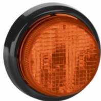
Part Number 0345521 12-24V ECE LED Turn Signal with 90mm Mounting Assembly Adapter