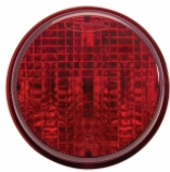
Part Number 0345431 12-24V ECE LED Rear Fog Light (Red) without 90mm Mounting Assembly Adapter