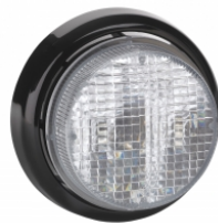
Part Number 0345451 12-24V ECE LED DRL & Front Position Light without 90mm Mounting Assembly Adapter