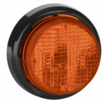
Part Number 0345521 12-24V ECE LED Turn Signal with 90mm Mounting Assembly Adapter