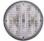
Part Number 0345461 12-24V ECE LED DRL & Front Position Light with 90mm Mounting Assembly Adapter