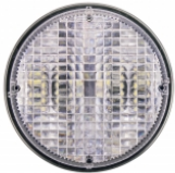
Part Number 0345511 12-24V ECE LED Rear Fog Light (Clear) without 90mm Mounting Assembly Adapter