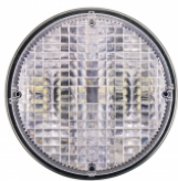
Part Number 0345421 12-24V ECE LED Backup Light without 90mm Mounting Assembly Adapter