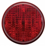
Part Number 0345431 12-24V ECE LED Rear Fog Light (Red) without 90mm Mounting Assembly Adapter