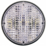
Part Number 0345421 12-24V ECE LED Backup Light without 90mm Mounting Assembly Adapter