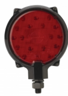
Part Number 0342781 12-24V ECE/SAE Single-Sided LED Stop & Tail Light with Guard