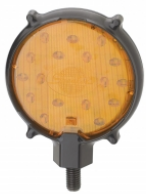
Part Number 0341931 12-24V SAE Double-Sided LED Turn Signal with Guard