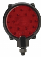
Part Number 0342781 12-24V ECE/SAE Single-Sided LED Stop & Tail Light with Guard