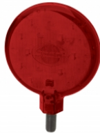
Part Number 0342771 12-24V ECE/SAE Single-Sided LED Stop & Tail Light without Guard