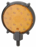
Part Number 0341931 12-24V SAE Double-Sided LED Turn Signal with Guard