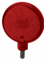
Part Number 0342771 12-24V ECE/SAE Single-Sided LED Stop & Tail Light without Guard